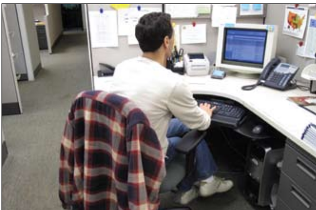
Worker-related issues, such as morale, pesticide concerns and cooperation, must be addressed.

3 Bed bugs disperse into other areas. Bed bugs disperse in two ways: walking or hitchhiking. It's hard to determine which is more important in offices. Our work with bed bug detection dogs suggests that bed bugs often travel in straight lines following aisles made by the base of cubicle dividers